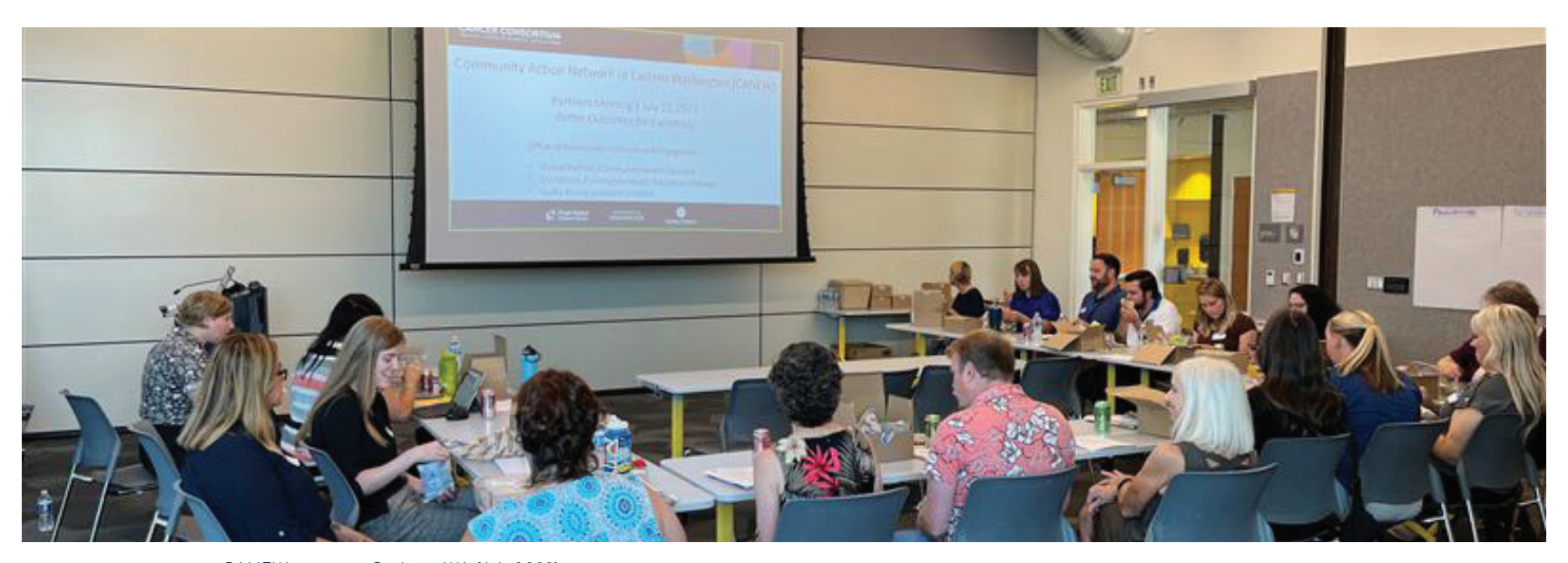
CANEW meeting in Spokane, WA (July 2023)