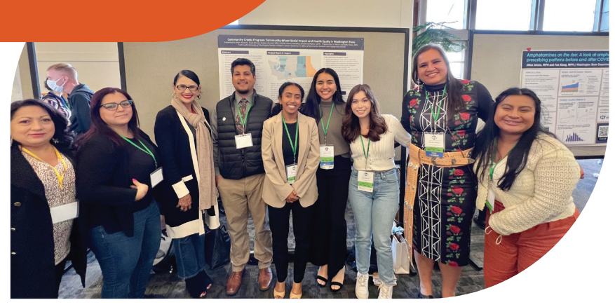
Community health educators at Washington State Public Health Association conference in Wenatchee, WA (October 2023)