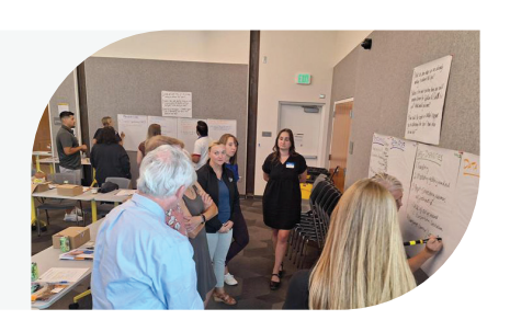
Breakout Sessions at a CANEW Meeting in July, 2023